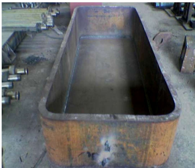
HOT ZINC BATH TANK