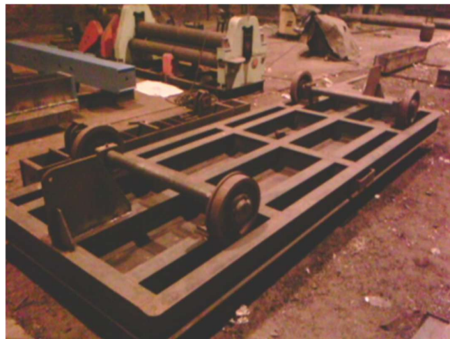
TRANSFER TROLLEY CARS