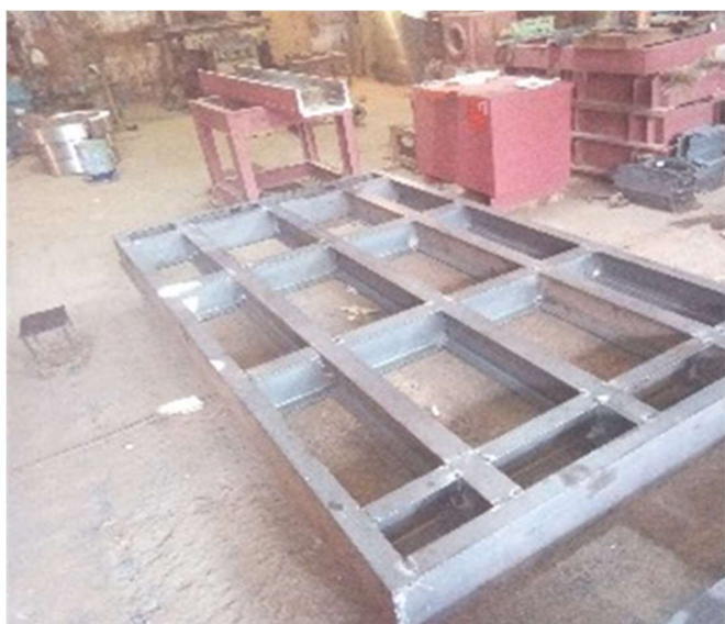
FABRICATED STRUCTURAL FRAME