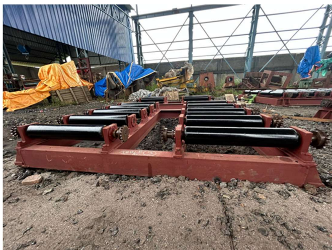
2 WAY CONVEYOR ROLLER TABLES