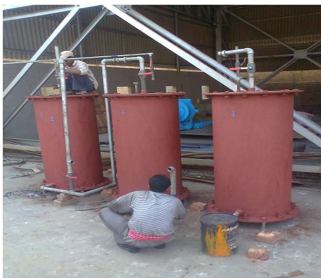
ARSENIC REMOVAL TANK ASSLY.