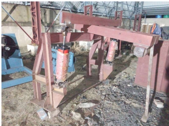
HINGE ARM WITH ACTUATOR