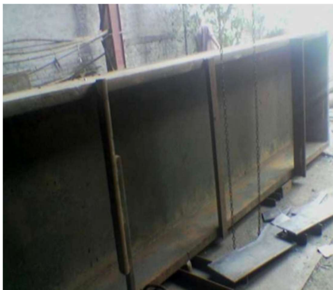
HOT LEAD QUENCHING TANK