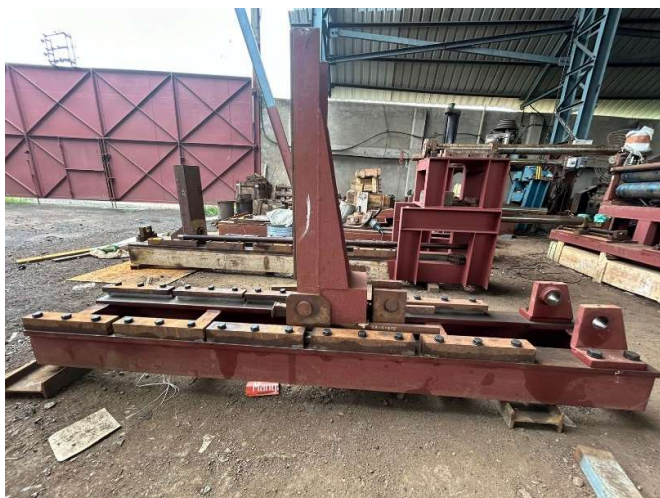
HINGE ENGINEERED FABRICATION ASSLY.